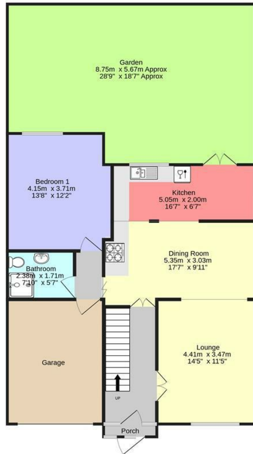
GROUND FLOOR 84.8 sq.m. (913 sq.ft.) approx.